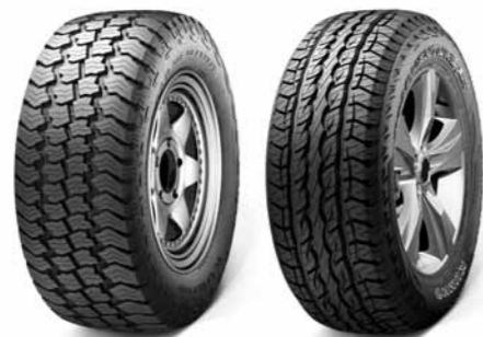
ROAD VENTURE AT KL78