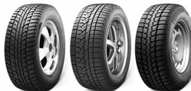
I'ZEN RV STUD KC16