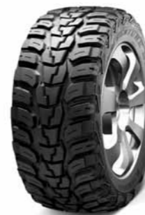
ROAD VENTURE MT KL71