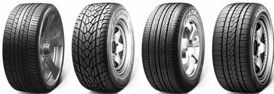
ECSTA X3 KL17