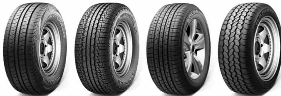
ROAD VENTURE APT KL51